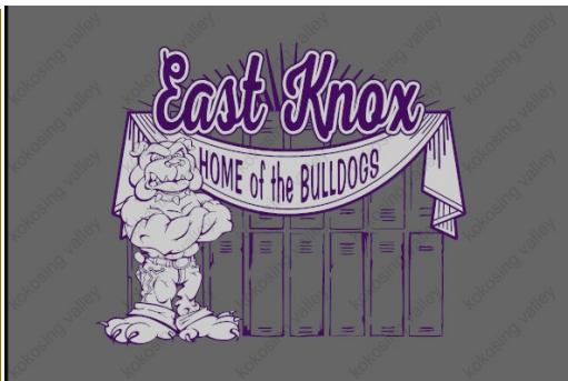
design #2 white/purple ink on dark grey shirt