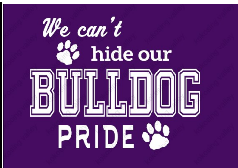
design #3 white ink on purple shirt