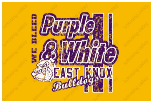
design #1 purple/white ink on yellow shirt