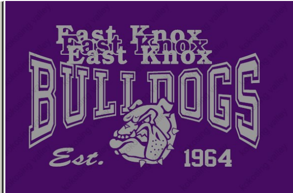
design #5 grey ink on purple stadium blanket (50" x 60")